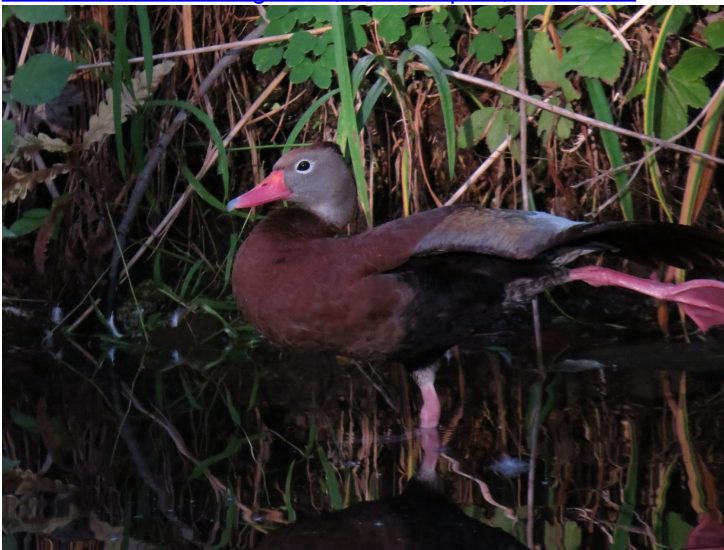
Black-bellied Whistling Duck, Northampton, PA.JPG