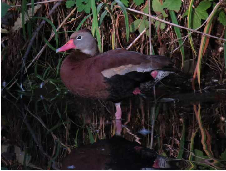
Black-bellied Whistling Duck, Northampton, PA 2.JPG