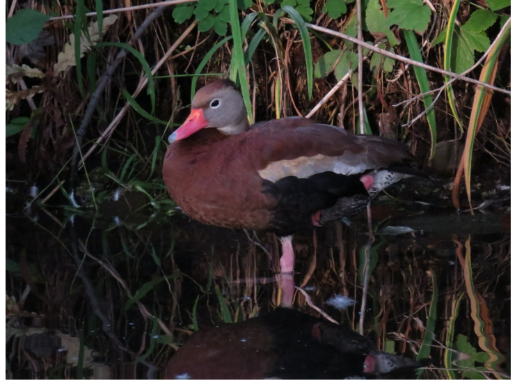
Black-bellied Whistling Duck, Northampton, PA 3.JPG